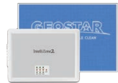
Designed for GeoStar