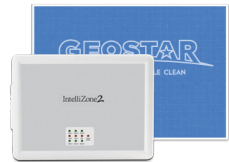
Designed for GeoStar